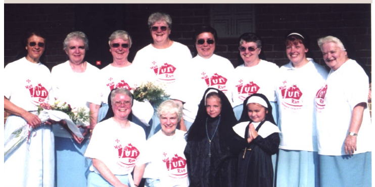
IHM Sisters from the first Nun Fun Run on September 17, 2005.

Join us for the Nun Fun Run Saturday, September 20, 2025