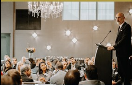
Quarterly luncheons with national speakers, diocesan clergy and local lay leaders