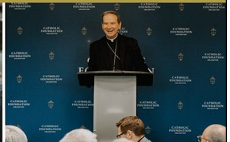
Engage directly with Bishop Burbidge