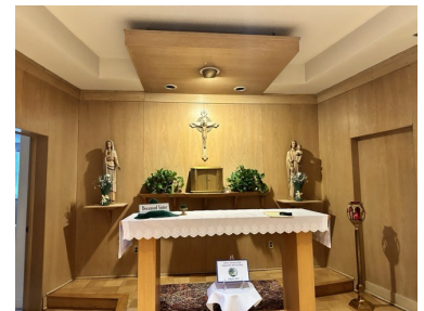
Convent chapel before (top) and after (bottom) renovation