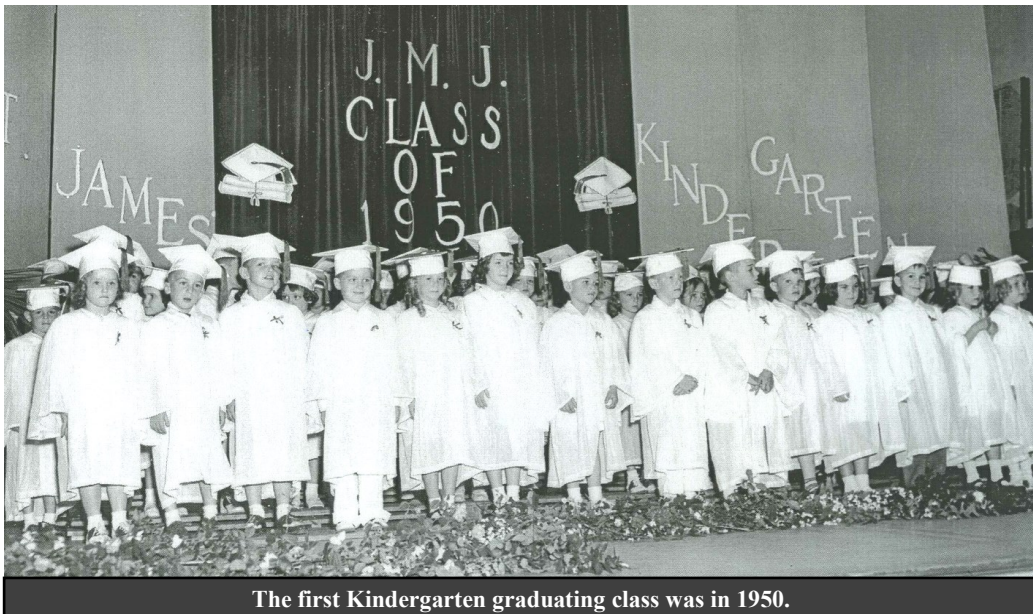
The first Kindergarten graduating class was in 1950.

In 1949, the first Kindergarten class began in Saint James School. The Kindergarten was first located in the white house behind the convent that was once occupied by Villa Maria Academy. Later Kindergarten classes were held in the primary wing of the school when it was completed in 1955.