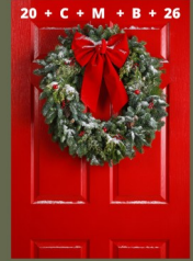
Epiphany Home Blessing

The letters can also stand for the traditional names of the Magi who visited Christ: Caspar, Melchior, and Balthazar.