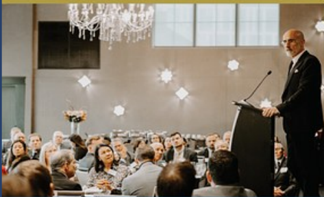
Quarterly luncheons with national speakers, diocesan clergy and local lay leaders