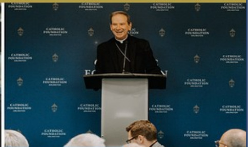
Engage directly with Bishop Burbidge