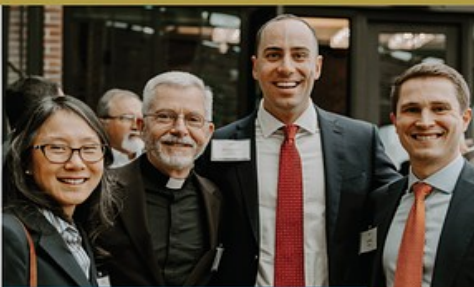
Network with Catholic leaders in a welcoming community