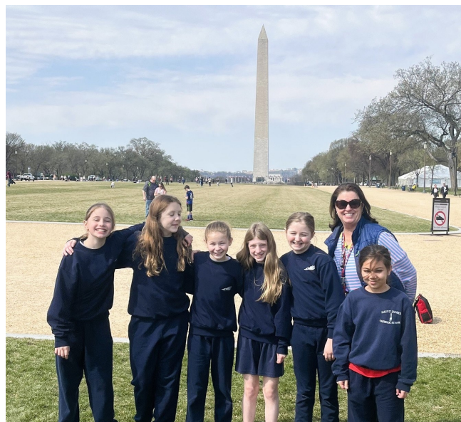
Our fifth graders visited the Natural History Museum and enjoyed the sites on the Mall.