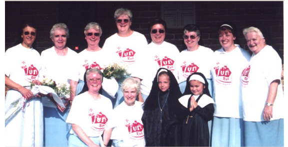
IHM Sisters from the first Nun Fun Run on September 17, 2005.

Join us for the Nun Fun Run Saturday, September 20, 2025