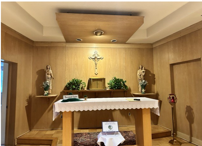
Convent chapel before renovation