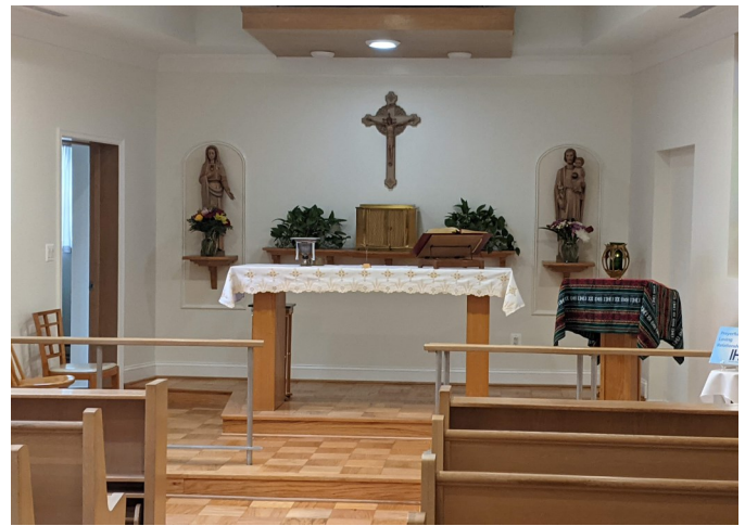
Convent chapel after renovation