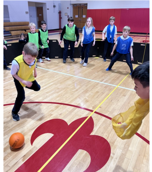
Students learn the techniques for Gaga Ball.