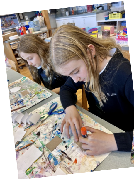
Students create their accordion book during Bookmaking Techniques class.