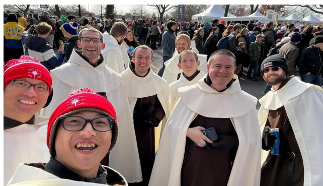
Brothers studying at Catholic University of America attending the March for Life in D.C.

Your generosity in supporting the Carmelite Friars’ missionary work is greatly appreciated.